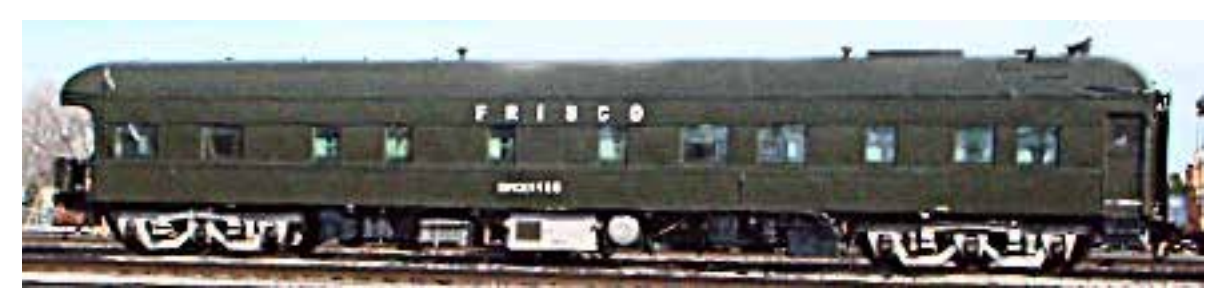
A heavyweight seen in Collinwood Yard on April 7, 2013.

Over to modelling, I found a use for old carpet tiles. I place them under my model work area to "maybe" catch small parts as I drop them!