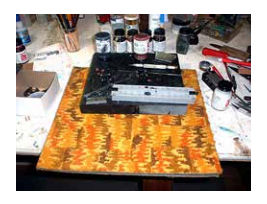
Joe Kurilec, MMR

I use a flat surface for support, in this example, it is a piece of ceramic something. I think it was a countertop.